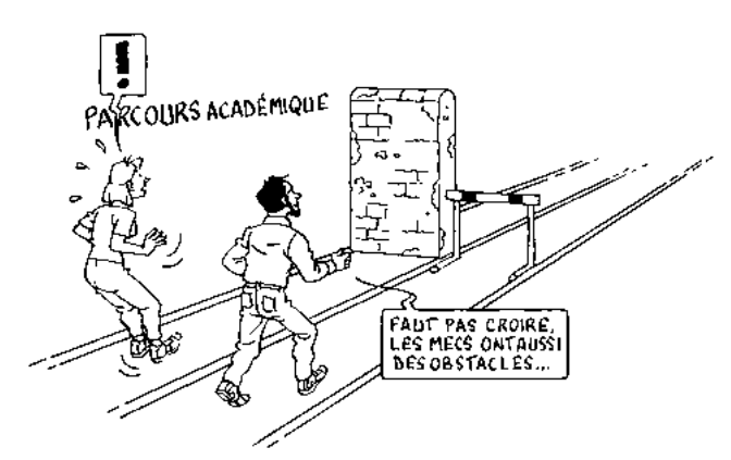
Text: Academic career path Man on the right: Don't fool yourself, men face barriers too...

During the conference, various people gave introductory speeches. We would like to thank each of these people with a quote from their speech: