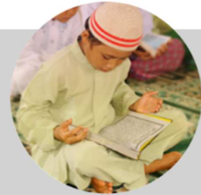
Prayer and Action