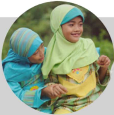
GNRC Global Network of Religions for Children