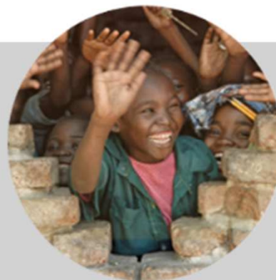
End Child Poverty