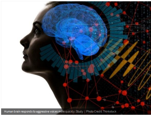
Human brain responds to aggressive voices more quickly: Study

N2ac is a component related to the focusing of attention within an auditory scene. Also, LPCpc activity - a cerebral marker of auditory attention - is also stronger for angry than for happy voices.