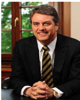
Robert AZEVEDO, Director-General, World Trade Organization (WTO)