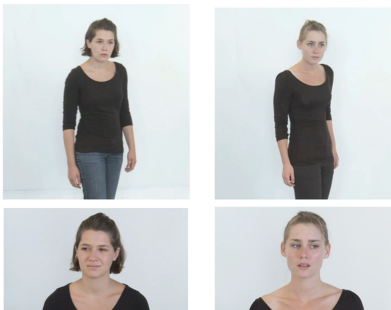
Figure 1. Examples of stimuli. Top: details of the static whole-body interest stimuli. Bottom: examples of the static head stimuli.

Apart from the affective responses, participants were instructed to select "other emotion" if they felt