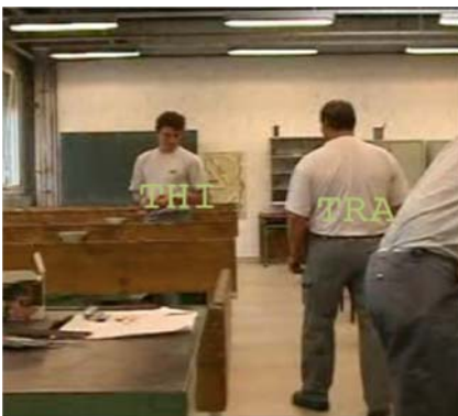
#1: TRA imitates THI's body position