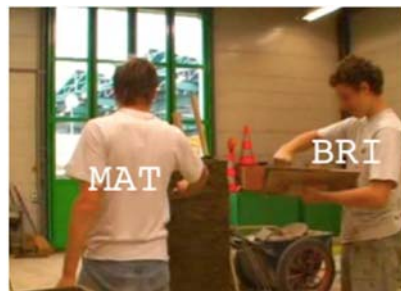
#2: MAT approaches the wall and shows BRI how to throw cement

When guiding the apprentice towards performing the specific arm movement required for throwing cement on the brick wall with his trowel, the trainer (TRA) brings two successive analogies to BRI's attention. The first analogy targets the inadequate arm position of BRI by linking it to a "crowbar" ("it looks like you've got a crowbar in your hands", l. 4). The second analogy elaborates on the similarity between the required movement and a ping-pong game ("you can't be any good at ping-pong you are not supple enough", l. 7–9).