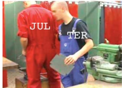
#2: TER leaves the anvil to JUL