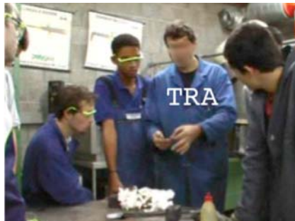
#1: TRA handles a piece of hardened steel

In this excerpt, the knowledge referred to by the trainer—the hardened steel —acts as the target referential domain: it is the chemical structure of this metal at that precise moment that is foregrounded in his explanation. The ice is used as a base or source referential domain: it belongs to an external conceptual field, imported to illustrate properties of the target. The notion of brittleness acts as a shared property between steel and ice before completion of the hardening process. It is that concept that acts as an analogical link between the imported source and the targeted knowledge.