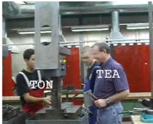
#1: TEA observes TON's iron sheet