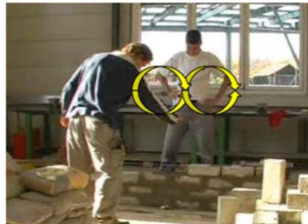
#2: TRA repeats the gesture with his right hand