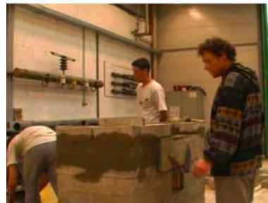
#2: PED goes back to THI's wall and shares his joke with him

Various resources are used by the trainer in order to teach THI to work faster. These resources consist in a non-verbal demonstration (i.e. spreading cement quickly), in linguistic instructions (“go on put this block next one two three”, l. 2) and in prosodic cues (an increasingly fast prosodic tempo when counting “one two three”). Finally, they take the form of an analogical comment: “I’ve already told you we’re not with Rolex right” (l. 4). In saying so, the trainer is drawing a link between the building and the clock industry. He is stressing the idea that the nature of these two occupations differ substantially and that masons should not work like clockmakers.