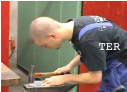
#1: TER hammers the iron sheet carefully on the anvil