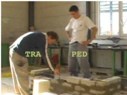
#1: TRA shows PED how to apply cement on bricks