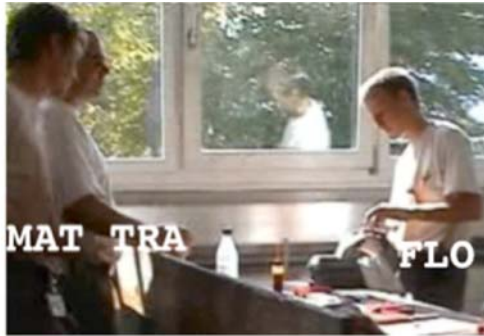
#1: FLO looks at the oil can used for tapping

In line 1, FLO implicitly asks the trainer (TRA) about the difference between the oil used for drilling and the oil used for tapping (“sir why don’t we use that for drilling”). In asking this question, he makes a connection between the activity he is currently conducting (the tapping) and an activity which he accomplished just before (the drilling). A local analogy thus begins to be woven between two close domains of reference. In line 2, TRA provides a first response to the question, by saying “because this one is made especially for that”. But for FLO this answer is not informative enough as shown by his reaction (“but what’s the difference”, l. 3). The trainer then elaborates a bit on his explanation (“well it’s not the same”, l. 4), and uses analogical discourse to build an explicit link between the tapping and the domain of car mechanics. He thus establishes a link between different kinds of oil used in general mechanics (lubricating oil for drilling vs. lubricating oil for tapping) and different kinds of oil used in car mechanics (motor oil vs. oil for the gearbox). He explains this relation by discussing a general property of oil: “it doesn’t have the same texture” (l. 8).