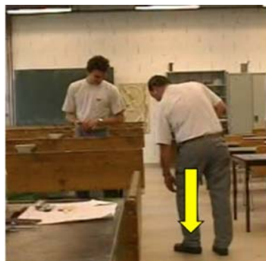
#2: TRA aligns his left knee to his foot

In this excerpt, it is again a specific body position that is being targeted by TRA's explanations. THI's position while filing the metal cube is seen as too stiff and this risks leading to an uneven surface of the metal piece. This false body position is both