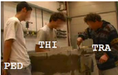
#1: TRA spreads cement with the trowel and shows THI how to work more quickly