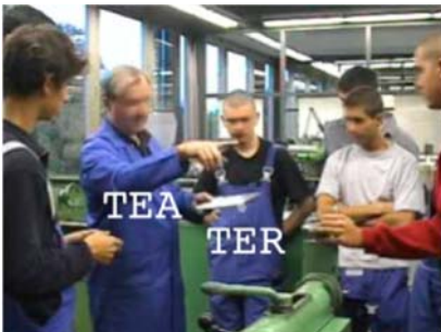
#1: TEA points the anvil and holds the iron sheet