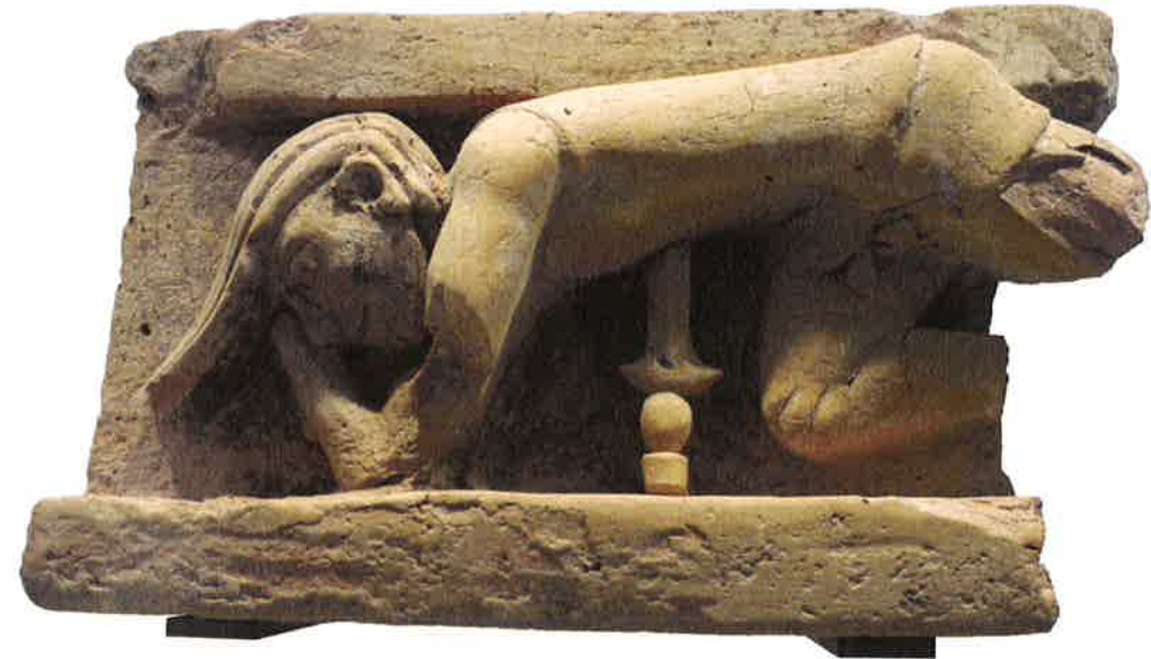
The suicide of Ajax. Ny Carlsberg Glyptotek, Copenhagen