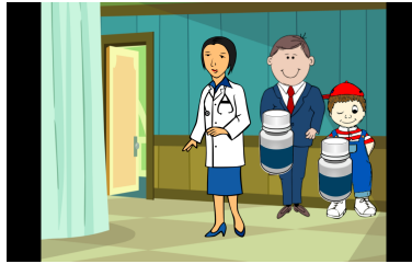
Figure 2: Example of an each control item.