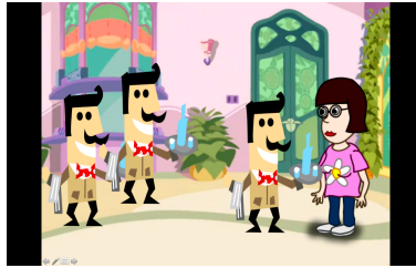
Figure 3: Example of an a control item.

In addition to the targets and controls, four fillers were used to balance the overall number of yes - and no -responses. Like the training items, fillers did not contain any quantifiers. Each of the filler stories could be associated with one of two different questions, one which would elicit a yes -response and one which would elicit a no -response (see (14) for an example). The experimenter selected the appropriate target based on the participant's response to the immediately preceding target item.