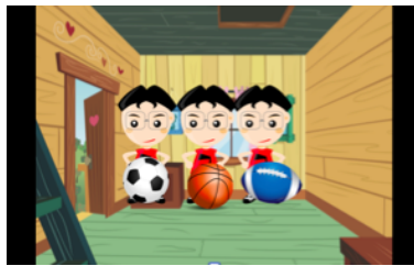
Figure 5: The boys enter the sport tournaments

Here, the surface scope-biasing context (20-a) explicitly mentions that we are interested in finding out whether there is a single individual who joined all tournaments, thereby making salient the question Is there a single individual who entered each tournament? In contrast, the inverse scope context (20-b) (accompanying Figure 5), similar to the contexts used in the present study, puts the emphasis on whether some boy or other joined all the tournaments. It therefore makes salient the question Is it true that for each tournament there is a boy who entered it? If our intuitions are correct, (21) should lead to a yes-answer more frequently when presented in context (20-b). We are currently collecting data on this follow-up.