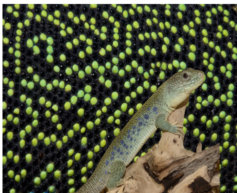
The skin colour pattern of this southwestern European lizard changes scale by scale.

The researchers were then surprised to see the brown juvenile scales change to green or black, then continue flipping colour (between green and black) during the life of the animal. This very strange observation prompted Milinkovitch to suggest that the skin scale network forms a so-called 'cellular automaton'. This esoteric computing system was invented in 1948 by the mathematician John von Neumann. Cellular automata are lattices of elements in which each element changes its state (here, its colour, green or black) depending on the states of neighbouring elements. The elements are called cells but are not meant to represent biological cells; in the case of the lizards, they correspond to individual skin scales. These abstract automata were