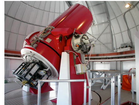
The 120 cm telescope of the Geneva Observatory at La Silla

We also take part in the development of instruments for the giant ground-based telescopes, essentially via ESO (European Southern Observatory). The construction of HARPS, quoted above, and the participation in GIRAFFE (multi-objects spectrograph) and PRIMA (micro-arcsecond Astrometry) for the VLT (Very Large Telescope) are such examples.