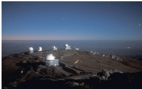
The European Observatory of La Silla in Chile

The ISDC (Integral Science Data Centre), established in 1995 at Ecogia some 3 km from Sauverny, is attached to the Geneva Observatory. Approximately 30 people are entrusted there with the reduction of the data transmitted by the INTEGRAL satellite of the European Space Agency (ESA) and their subsequent distribution to the users. This satellite observes in the gamma wavelength region of the electromagnetic spectrum. It was successfully placed in orbit on October 17, 2002.